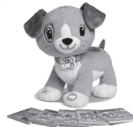
Read With Me Violet 2+ years

Get more ideas to support your child's learning at: leapfrog.com