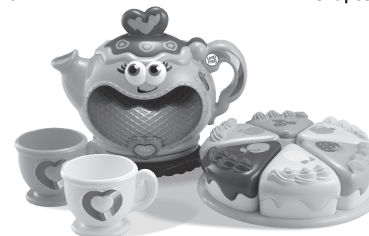
Musical Rainbow Tea Party 1-3 years