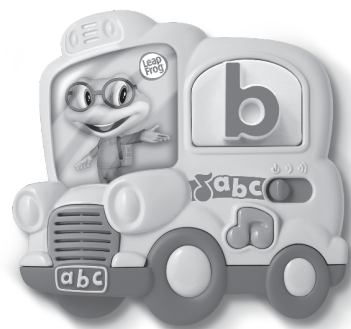
Fridge Phonics™ 2+ years