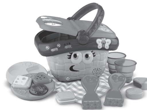
Shapes & Sharing Picnic Basket 6-36 months