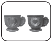
2 tea cups