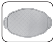
1 serving tray