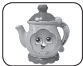
One Rainbow Tea for Two™ teapot