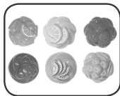
6 frosting pieces