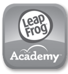
LeapFrog Academy © LeapFrog Enterprises