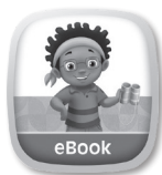
Get Ready for Kindergarten: Daniel's Pirate Adventure © LeapFrog Enterprises, Inc