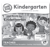
Get Ready for Kindergarten © LeapFrog Enterprises