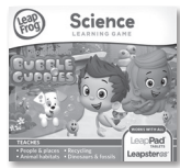
Bubble Guppies © Viacom International