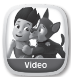
PAW Patrol: Pups Away! © Viacom International

Visit LeapFrog.com to see the full library.