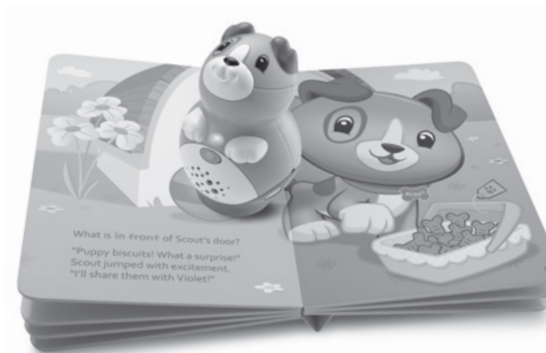
Tag™ Junior book pal* 1-4 years

...to reading discoveries with Tag Junior!