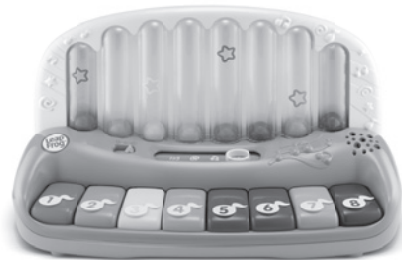
Poppin' Play Piano* 12-36 months