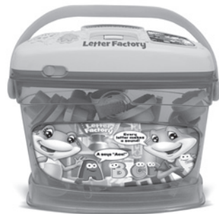
Letter Factory Phonics™* 2 years+