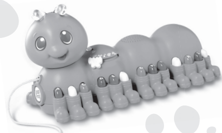
Alphabet Pal ™ 12+ months