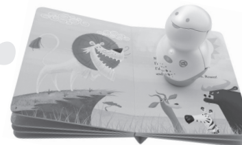
Tag ™ Junior Book Pal* 2-4 years

It's a hope you have for your child and one that LeapFrog shares. Toys like Alphabet Pal help bring letters to life, encouraging children on their first steps toward reading.