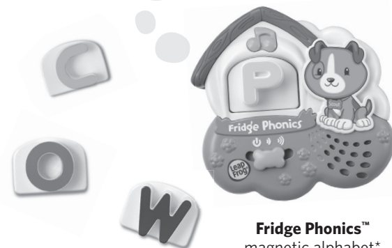
Fridge Phonics ™ magnetic alphabet* 2+ years

Get more ideas to support your child's learning at: leapfrog.com/learningpath