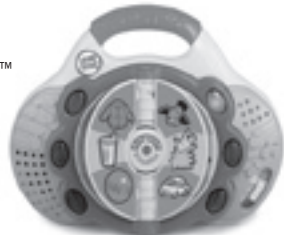
Learn & Groove™ First Words Radio 12+ months