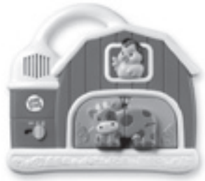
Fridge Farm™ magnetic animal set 12+ months