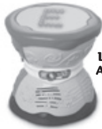
Learn & Groove™ Alphabet Drum 6+ months