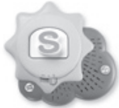
Fridge Phonics™ magnetic alphabet 2+ years