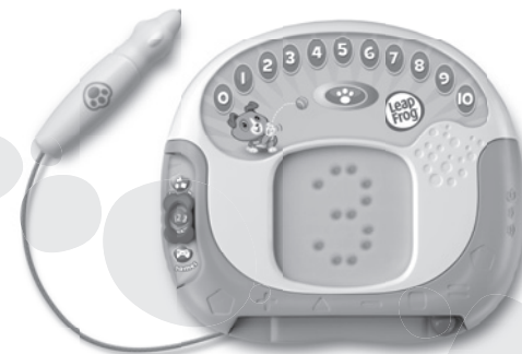
Count & Draw 3+ years

A child's first experiences with learning can shape a lifelong love of discovery. From letters and shapes to numbers and early mathematics, Scribble & Write and Count & Draw are designed to be complementary learning companions. Engaging activities, a puppy pal guide and both skill sets work together to start little learners on the path to preschool readiness.