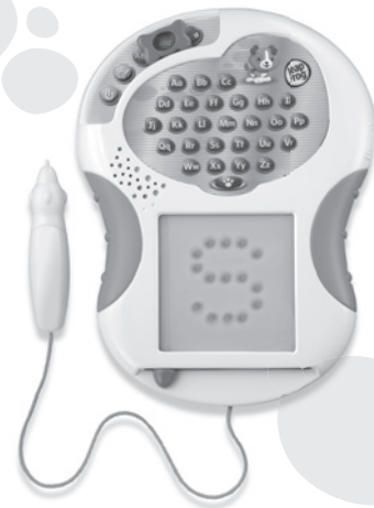
Scribble & Write* 3+ years

A child's first experiences with learning can shape a lifelong love of discovery. From letters and shapes to numbers and early mathematics, Scribble & Write and Count & Draw are designed to be complementary learning companions. Engaging activities, a puppy pal guide and both skill sets work together to start little learners on the path to preschool readiness.