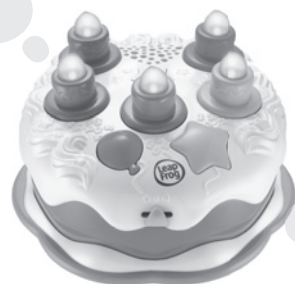
COUNTING CANDLES™ BIRTHDAY CAKE 12+ months