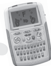
TEXT & LEARN* 3+ years