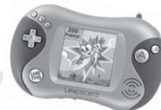
LEAPSTER™ 2 LEARNING GAME SYSTEM* 4-8 years