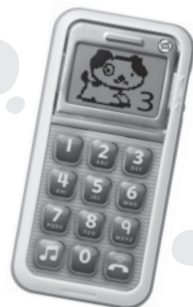
CHAT & COUNT PHONE* 18+ months