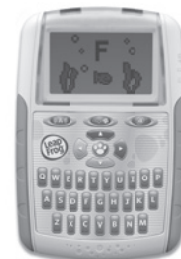
TEXT & LEARN* 3+ years