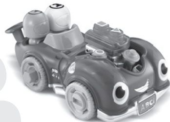
FIX & LEARN SPEEDY 18-36 months