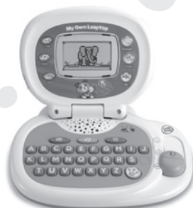
MY OWN LEAPTOP™* 2+ years