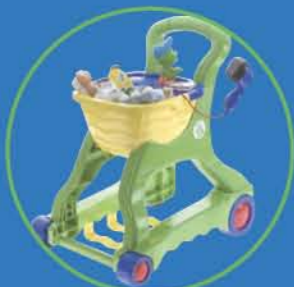
LEAPFROG™ Shopping Cart 2+ years