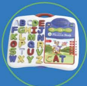
Learn to Read Phonics Desk™ System 3+ years