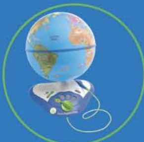
Junior Explorer Globe 3+ years