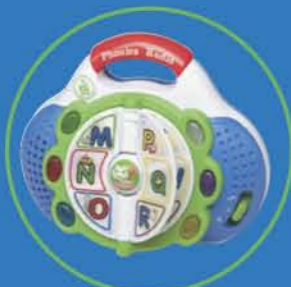
Phonics Radio 18+ months