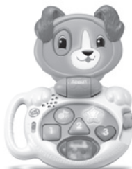
My Talking LapPup™

Scout & Friends toys help children build important preschool and kindergarten skills while encouraging pretend play anytime, anywhere!