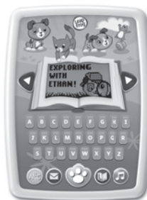
My Own Story Time Pad*