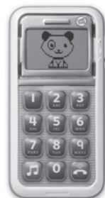
Chat & Count*