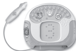
Count & Draw*