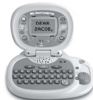
My Own Leaptop™*