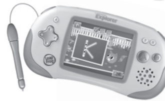
LEAPSTER EXPLORER™ LEARNING EXPERIENCE* 4-9 years

Get more ideas to support your child's learning at: leapfrog.com/learningpath