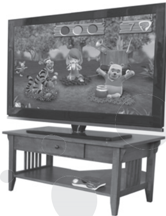
ZIPPITY™ LEARNING SYSTEM* 3-5 years