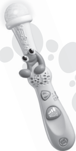
LEARN & GROOVE™ MUSIC WAND 3+ years

It's a hope you have for your child and one that LeapFrog shares. Toys like Music Wand help engage children's minds as well as their bodies by encouraging them to move as they learn.