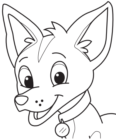
Biggs just got a new toy.