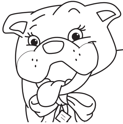
Lola loves fashion.

Read the sentences. For each puppy, decide which friend would make a good match.