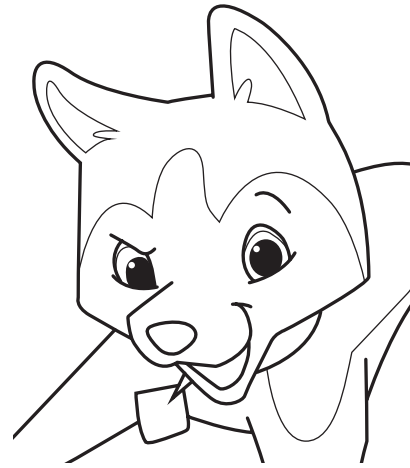
Cooper wants to play.