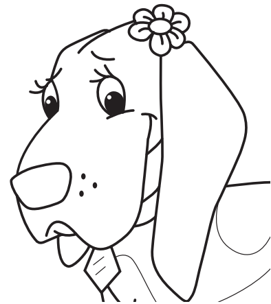
Mona is hungry.