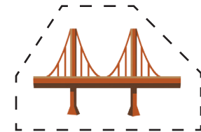
Golden Gate Bridge