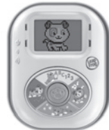
Learn & Groove® Music Player* 18+ months

Scout & Friends toys help children build essential preschool and kindergarten skills while encouraging pretend play anytime, anywhere!