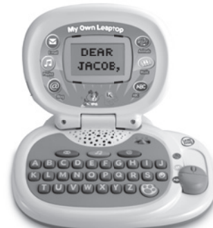
My Own Leaptop™* 2+ years