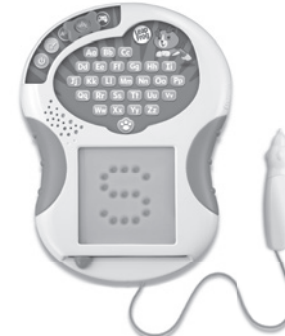
Scribble & Write* 3+ years

*Products sold separately, and may not be available in all countries. Actual products may vary.