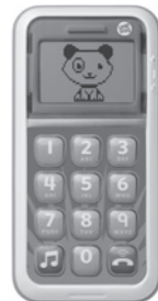
Chat & Count* 18+ months