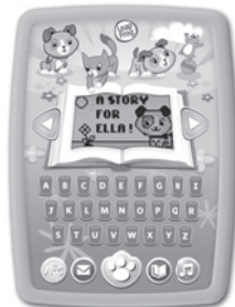
My Own Story Time Pad* 2+ years