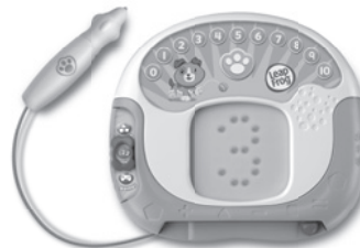
Count & Draw* 3+ years