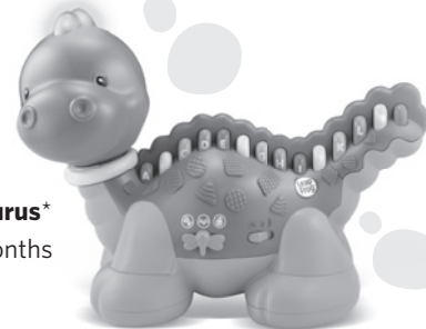
Lettersaurus* 12-36 months

Get more ideas to support your child's learning at: leapfrog.com/learningpath