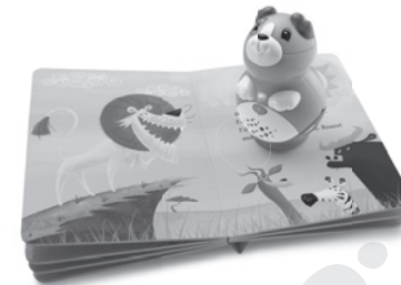
Tag™ Junior book pal* 2-4 years