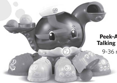
Peek-A-Shoe™ Talking Octopus 9-36 months