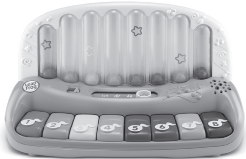
Poppin' Play Piano* 12-36 months