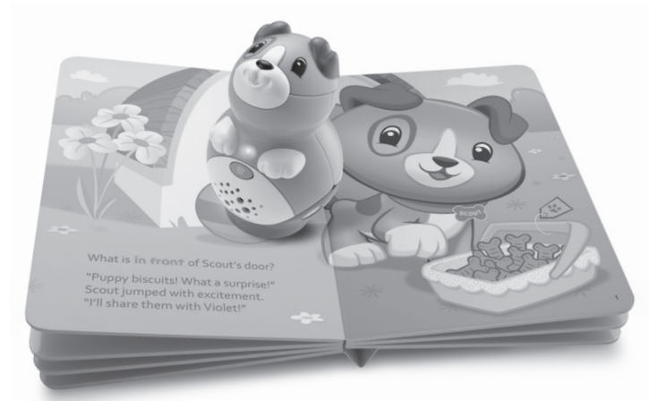
Tag™ Junior book pal* 1-4 years

...to reading discoveries with Tag Junior!