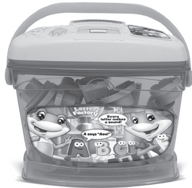
Letter Factory Phonics™* 2 years+