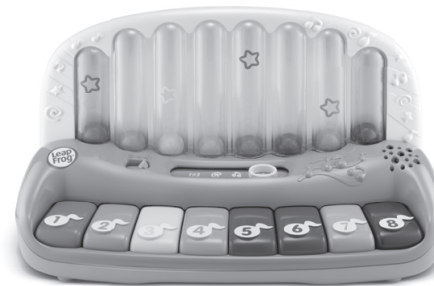
Poppin' Play Piano* 12-36 months

Get more ideas to support your child's learning at: leapfrog.com/learningpath