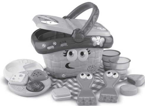
Shapes & Sharing Picnic Basket* 6-36 months