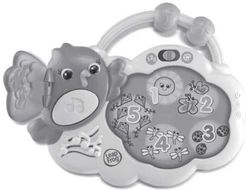
Musical Counting Pal™* 6-36 months