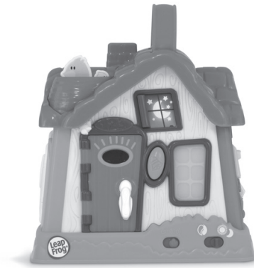
My Discovery House* 6-36 months