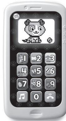
Chat & Count