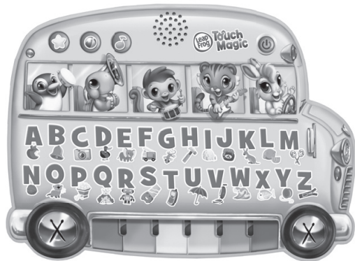
Touch Magic™ Learning Bus 2+ years