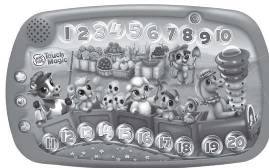
Touch Magic™ Counting Train 2+ years