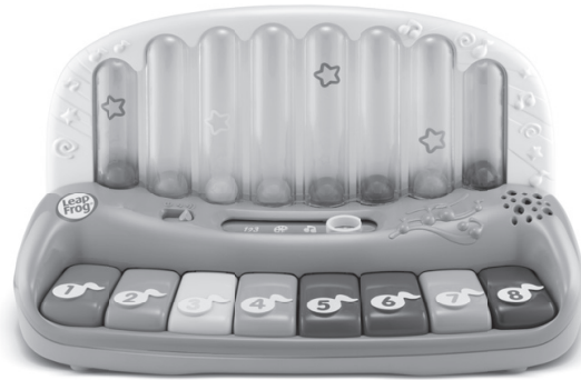
Poppin' Play Piano 12-36 months