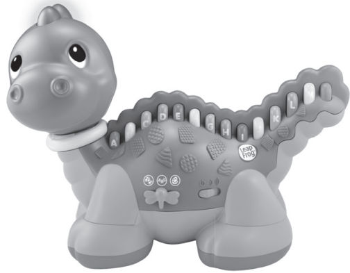
Lettersaurus 12-36 months