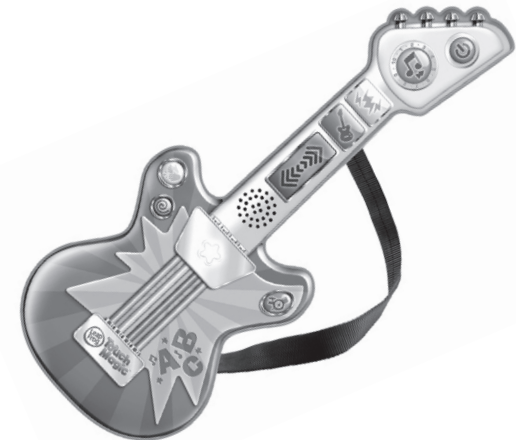
Touch Magic™ Rockin' Guitar 3+ years

Get more ideas to support your child's learning at: leapfrog.com/learningpath