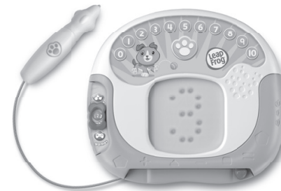
Count & Draw*