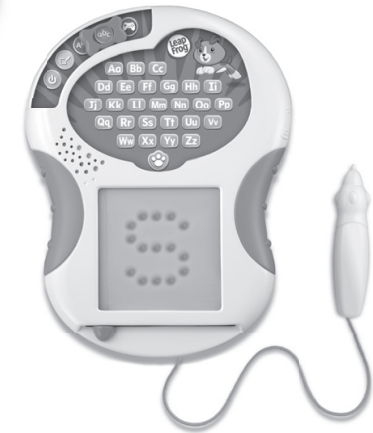
Scribble & Write*