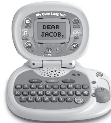
My Own Leaptop™*