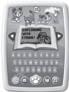
My Own Story Time Pad*