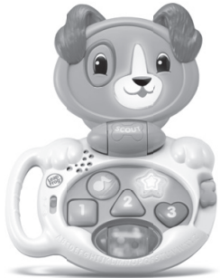
My Talking LapPup™

Scout & Friends toys help children build important preschool and kindergarten skills while encouraging pretend play anytime, anywhere!