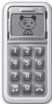
Chat & Count*