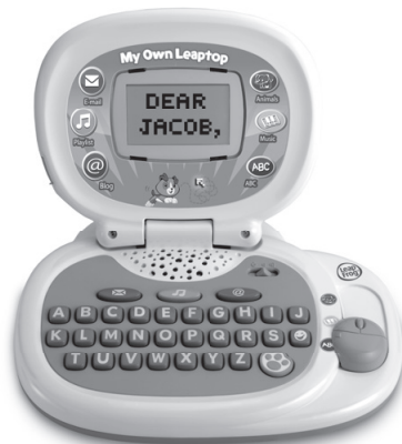
My Own Leaptop™* 2+ years