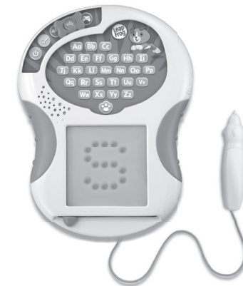
Scribble & Write* 3+ years