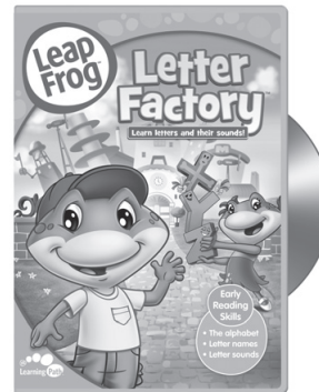
Letter Factory™ DVD* 2+ years