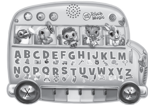
Touch Magic™ Learning Bus* 2+ years