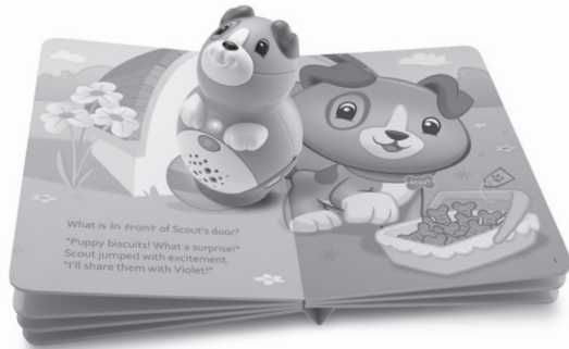
Tag™ Junior book pal* 1-4 years