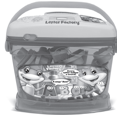
Letter Factory Phonics™* 2+ years