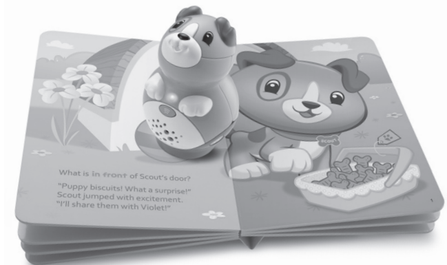
Tag™ Junior book pal* 1-4 years

...to reading discoveries with Tag Junior!