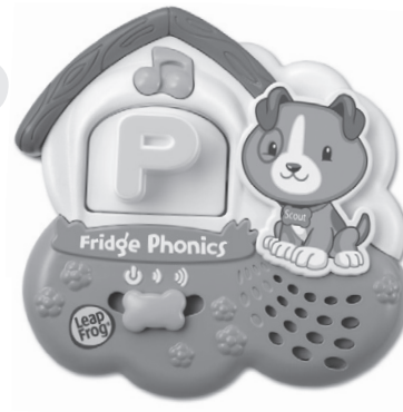
Fridge Phonics® magnetic alphabet*