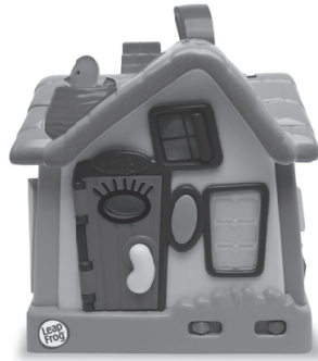
My Discovery House