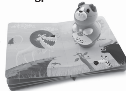
Tag™ Junior book pal* 2-4 years

It's a hope you have for your child and one that LeapFrog shares. Toys like My Discovery House combine the joy of play with skills to help children take their next steps toward a lifelong love of learning. Get more ideas to support your child's learning at: leapfrog.com/learningpath