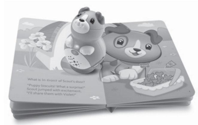
Tag™ Junior book pal* 1-4 years

Get more ideas to support your child's learning at: leapfrog.com/learningpath