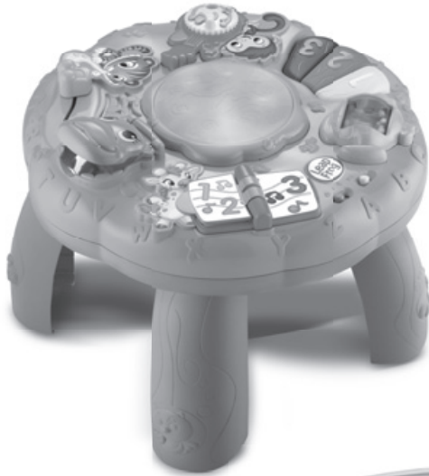
Animal Adventure Learning Table* 6-36 months