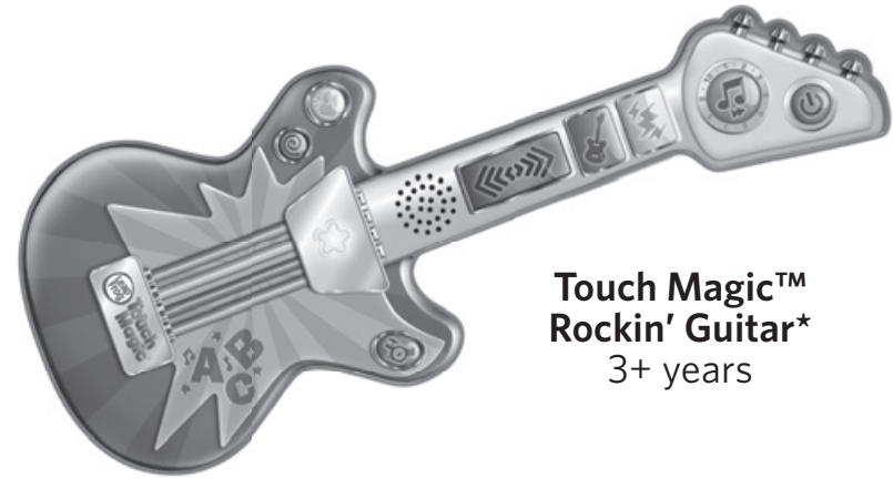
Touch Magic™ Rockin' Guitar* 3+ years