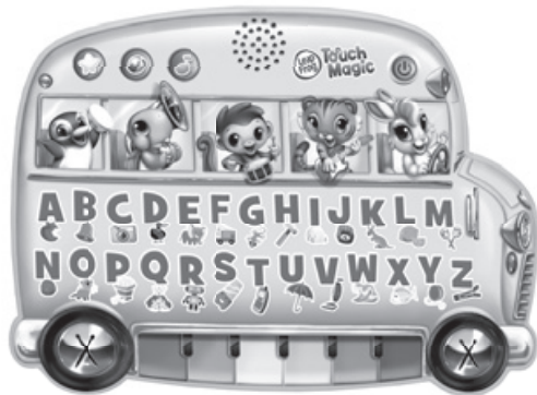
Touch Magic™ Learning Bus* 2+ years