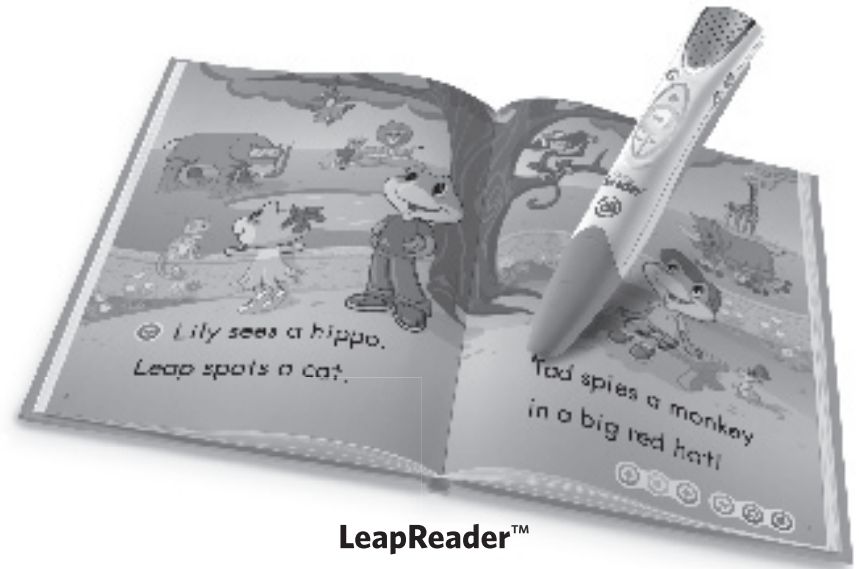
LeapReader™ 4-8 years