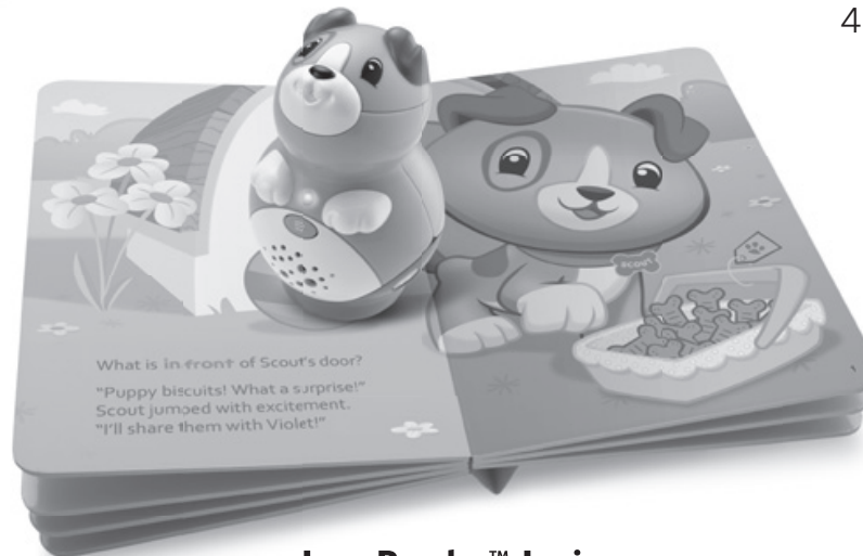
LeapReader™ Junior 1-4 years

Get more ideas to support your child's learning at: leapfrog.com/learningpath