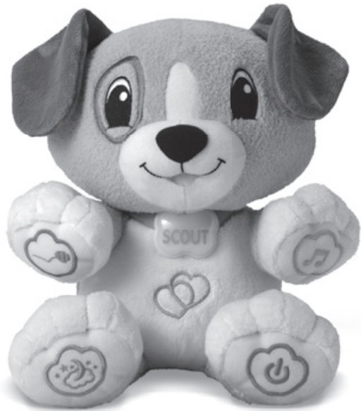
My Pal Scout 6-36 months