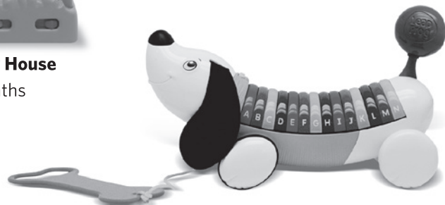
AlphaPup™ 12+ months