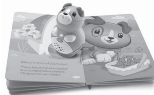
Tag™ Junior book pal* 1-4 years

Get more ideas to support your child's learning at: leapfrog.com/learningpath