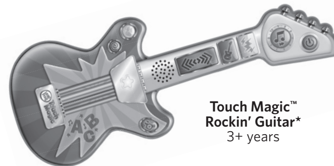
Touch Magic™ Rockin' Guitar* 3+ years