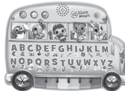
Touch Magic™ Learning Bus* 2+ years