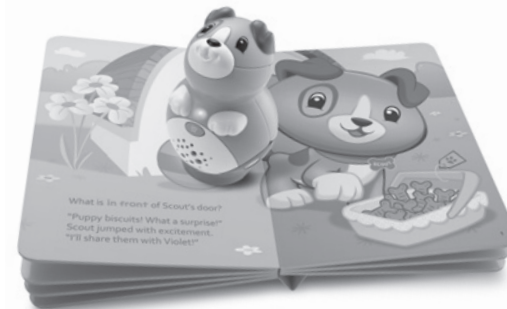
Tag™ Junior book pal* 1-4 years

...to reading discoveries with Tag Junior!